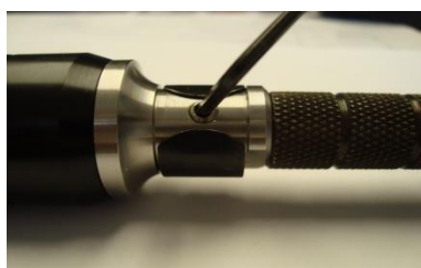
Fig 4 Lock the protective hose on the handpiece using a screw